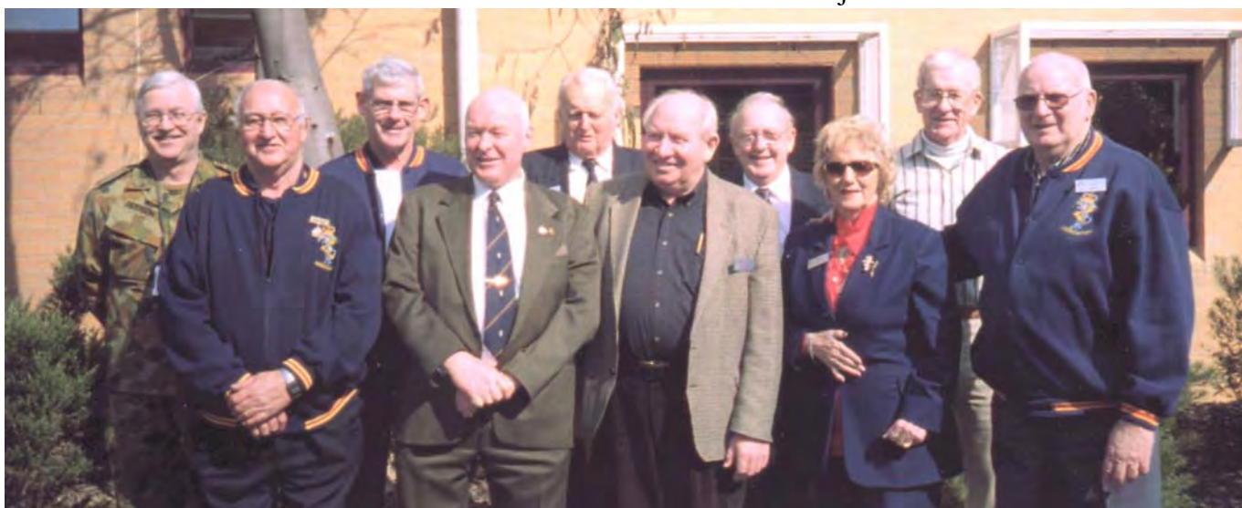
Committee - 2003