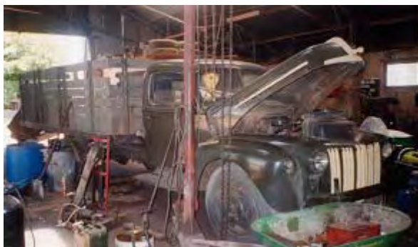
The Ford after it was cleared of scrap & arrived in WA