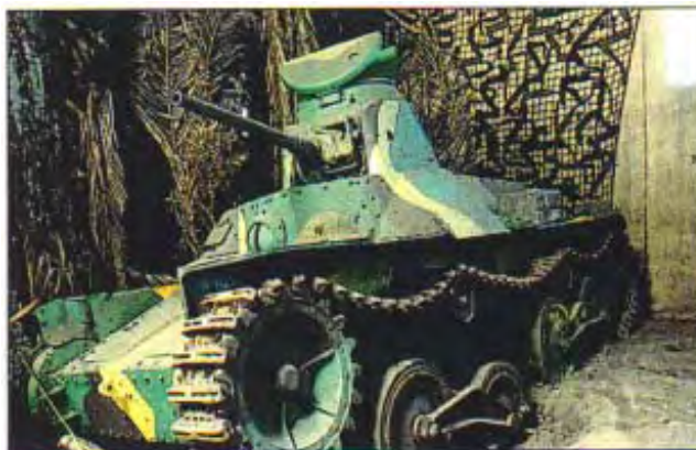
Japanese Light Tank, Captured by Australians at Milne Bay, PNG