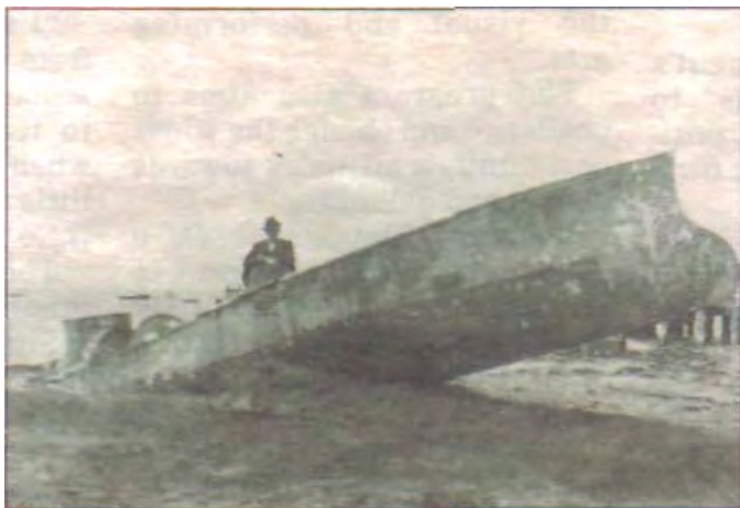
The torpedo boats represented colonial Victoria's first line of defence.