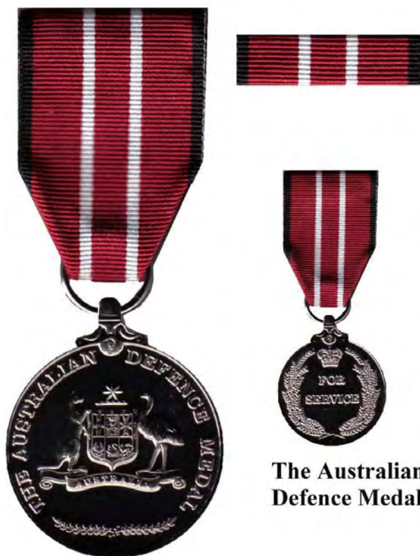
The Australian Defence Medal

Ribbon: Maroon with black border; white stripes