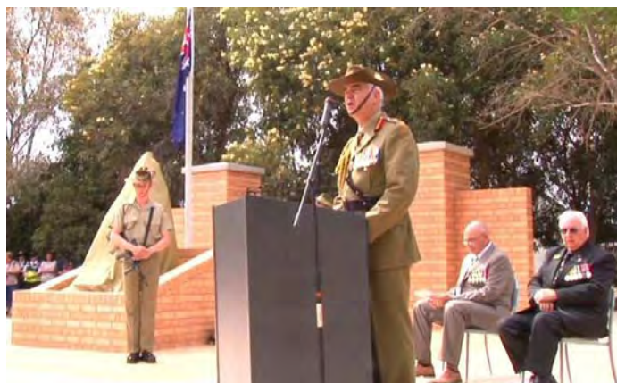
Lt.Gen Ken Gillespie Dedicates the Army Apprentice Memorial

Patron: Lieutenant General Ken Gillespie, AO, DSC, CSM, Chief of Army (23 rd Intake Army Apprentice Bricklayer)