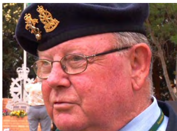
Retired RAEME ex-Army Apprentice