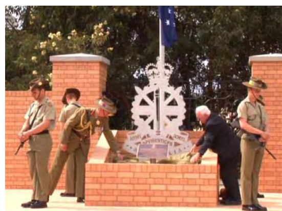
Army Apprentice Memorial Plaque