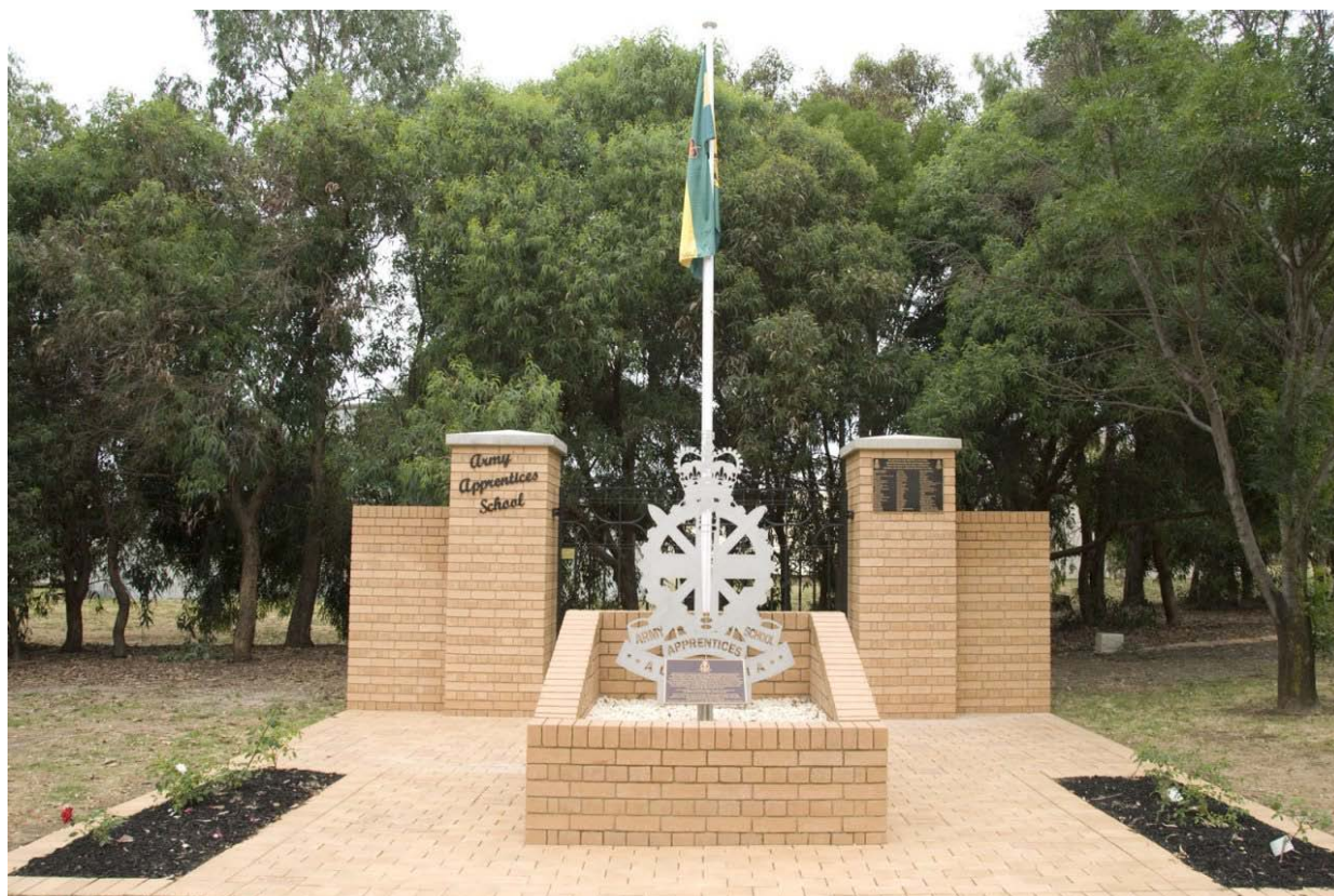
The Army Apprentice Memorial and Plaque at Bandiana, to which our Association contributed