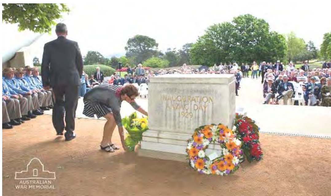
Army Apprentices Reunion, Canberra October 2011 Wreath Laying at the Australian War Memorial