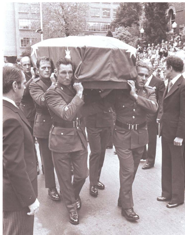
Sir Robert Gordon Menzies Funeral