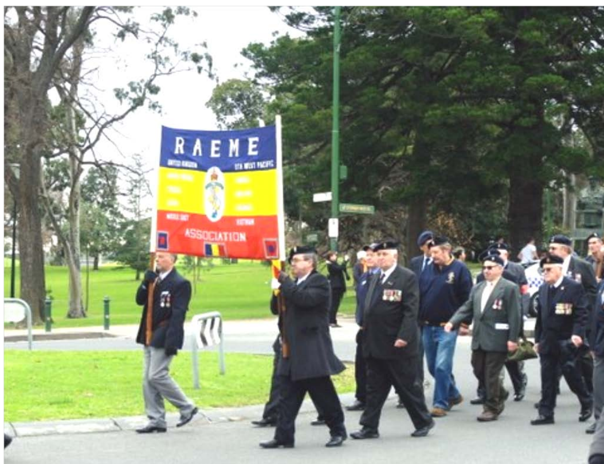
Reserve Forces Day Parade Sunday 1 July 2012

© RAEME Association of Victoria (Inc) 2012. Except as provided by the Copyright Act 1968, no part of this publication may be reproduced, stored in a retrieval system or transmitted in any form or by any means including posting to social media without the prior written permission of the publisher.