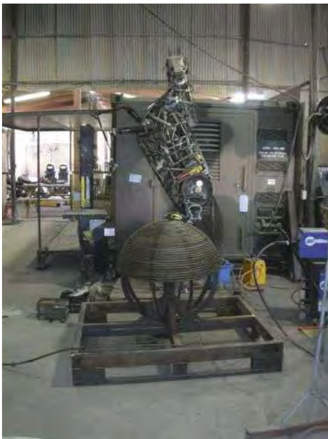
Corps "Centre Piece" Under Construction

The "Corps Centrepiece" was constructed in Camp Russell, Tarin Kowt, between December 2011 and July 2012. Up to this time, each Special Operations Task Group (SOTG) workshop rotation manufactured a plaque to mark their deployment, and these plaques hang in the General Engineering shed. The plaques have become something of a tradition, and each one is unique, creative and novel.