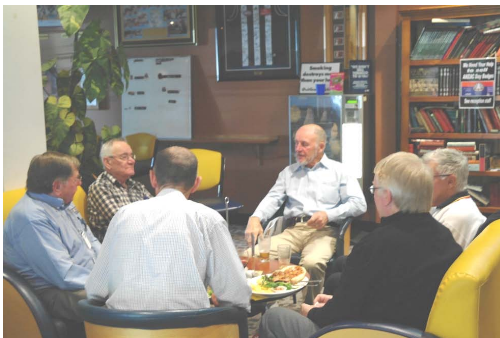
Our young Veterans swapping tales

Old and Bolds, Vietnam Veterans, Serving Members, Ladies