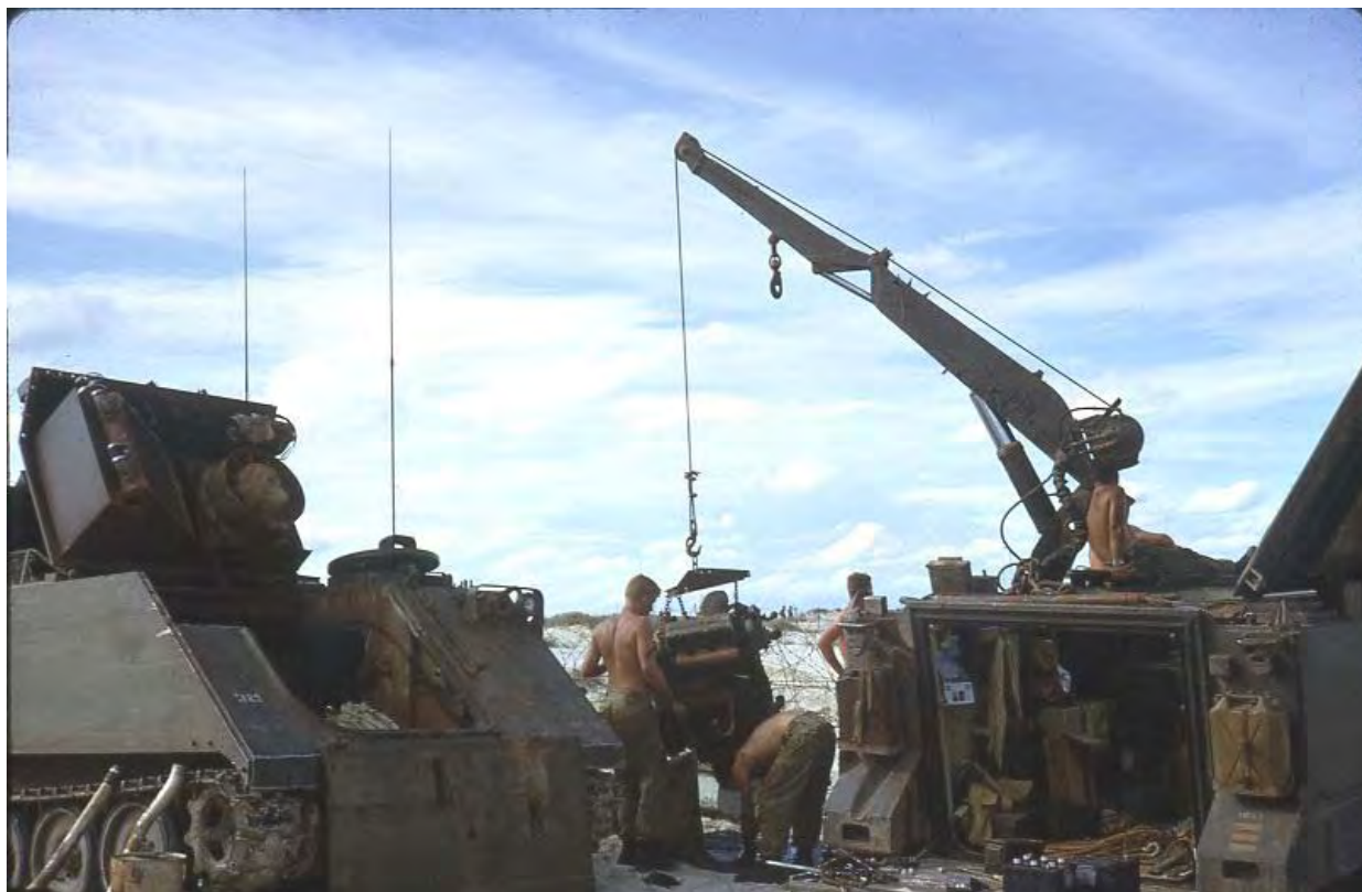
A SQN 3 CAV LAD changing an M113 APC engine on Operation Leeton May 1967

Operation Leeton continued in phases in Vietnam from 6 March to 1 Jun 1967 and involved the construction of a 10 km long barrier minefield between the “Horseshoe” and the South China Sea near Long Hai. Engineers laid mines, Infantry and Cavalry patrolled out from the field and carried materiel from choppers, while local Regional forces assisted.