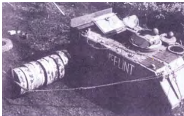
"Flint" beside the minefield August 1969. The mine killing roller designed by Capt. John Power and built by the RAEME Workshop is fitted to the back of the vehicle. The protective steel plates at the rear are clearly visible.

One Field Squadron sappers were now set a challenge. The mine field was always under observation from enemy eyes. During the initial laying, some of the mines were sometimes relocated to supposed safe areas, causing casualties. The Vietnamese children were a concern even in the event of setting up harbour positions, as they were always in danger in the event of an attack. They were also a source of information to the enemy.