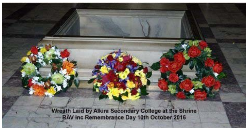
Wreath Laid by Alkira Secondary College at the Shrine — RAV Inc Remembrance Day 10th October 2016