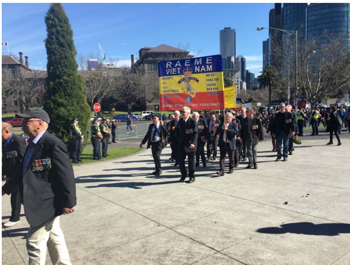
RAEME Vietnam Veterans Marching on Long Tan Day

© RAEME Association of Victoria (Inc) 2012. Except as provided by the Copyright Act 1968, no part of this publication may be reproduced, stored in a retrieval system or transmitted in any form or by any means including posting to social media without the prior written permission of the publisher.