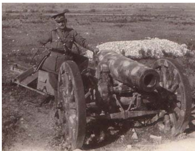
Captured German Gun - WW1