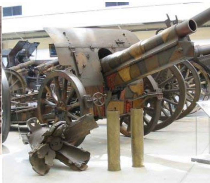
Spiked Breech of Captured German Gun