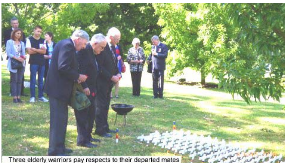
Three elderly warriors pay respects to their departed mates