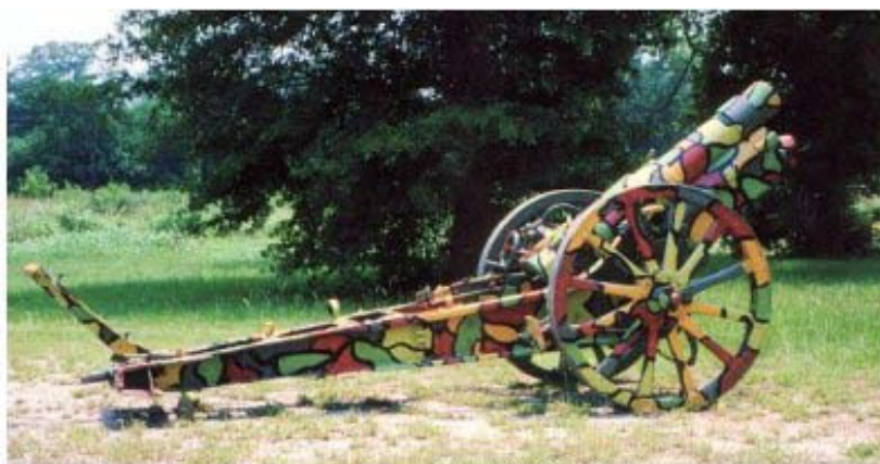
Renovated German Gun with WW1 Style Camouflage