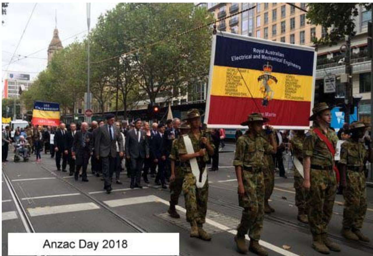
Anzac Day 2018

© RAEME Association of Victoria (Inc) 2012. Except as provided by the Copyright Act 1968, no part of this publication may be reproduced, stored in a retrieval system or transmitted in any form or by any means including posting to social media without the prior written permission of the publisher.