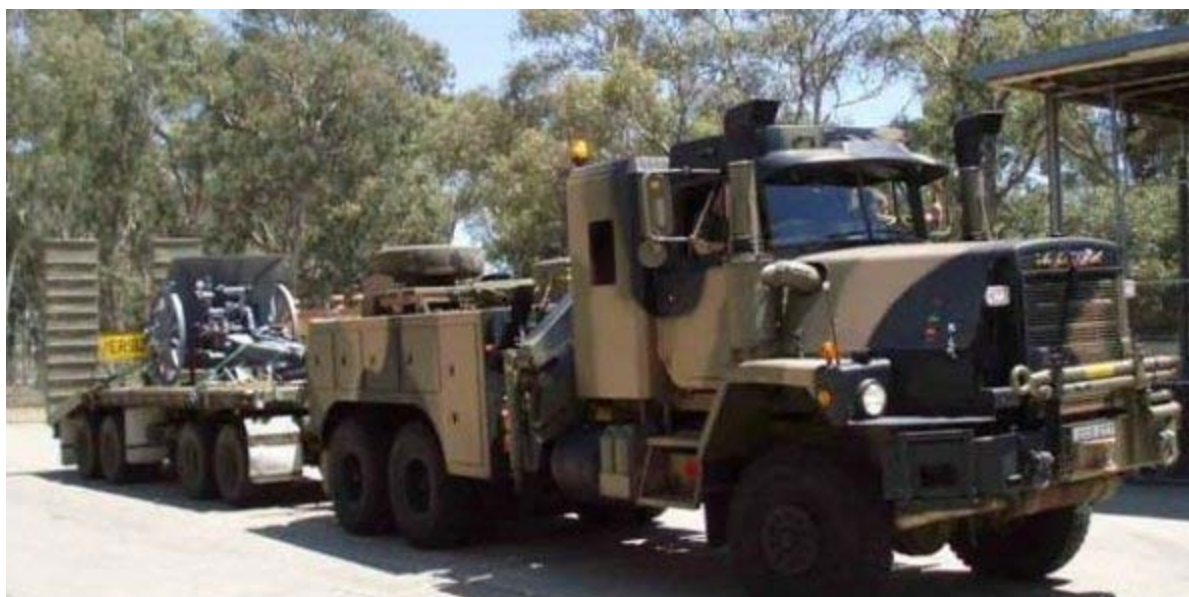
Transport of old WW1 Captured German Gun by SA Wksp Coy.