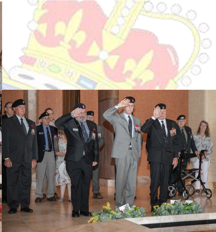
1st pic is of two Tunnel Rats.