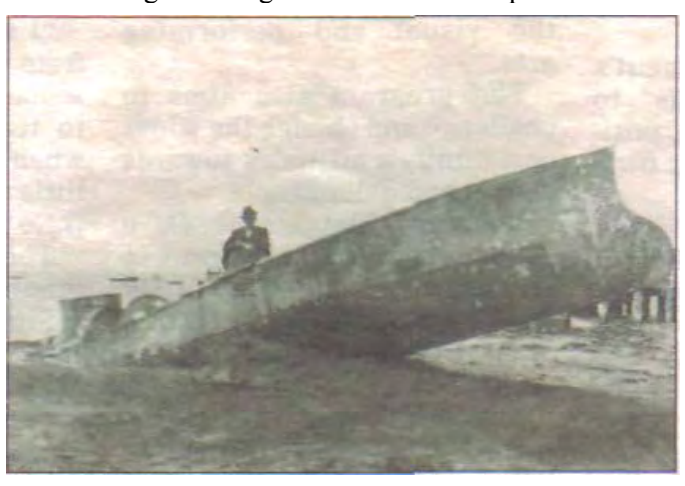
The torpedo boats represented colonial Victoria's first line of defence.