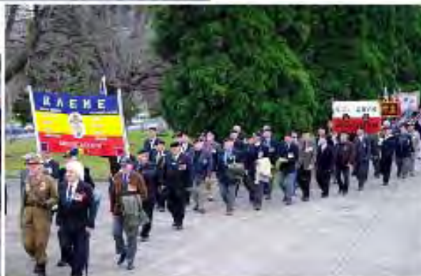
Reserve Forces Day Parade - 3 July 2011

Members requiring a Name Badge @ $10-00 ea can contact Alan Rogers