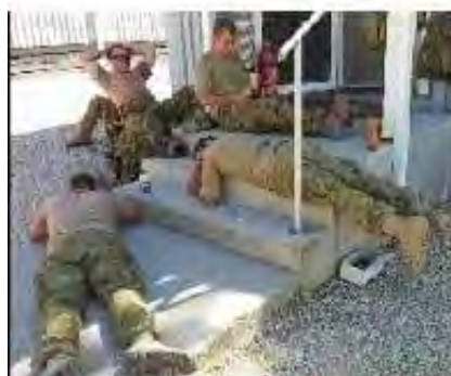
What my boss thinks I do