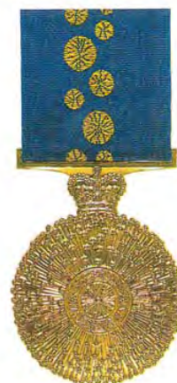
Medal of the Order of Australia