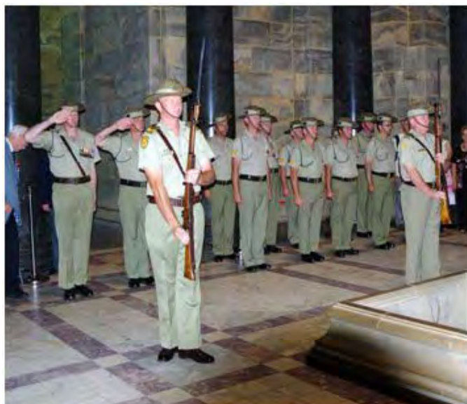
Honour guard in the Sanctuary