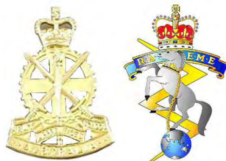
A Worthy Progression