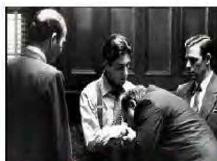
What other Corps think I do