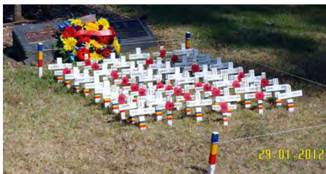
Memorial Crosses at the RAEME Tree and Association Plaques