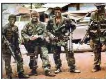
What my Mum thinks I do