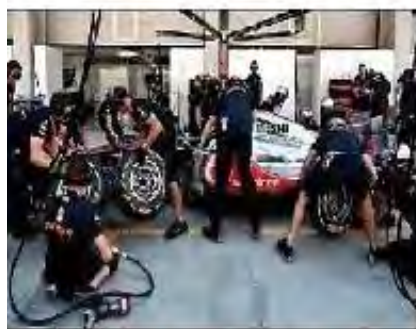
What my friends think I do