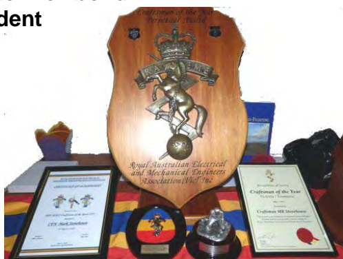
The Craftsman of the Year Award Shield and Certificates