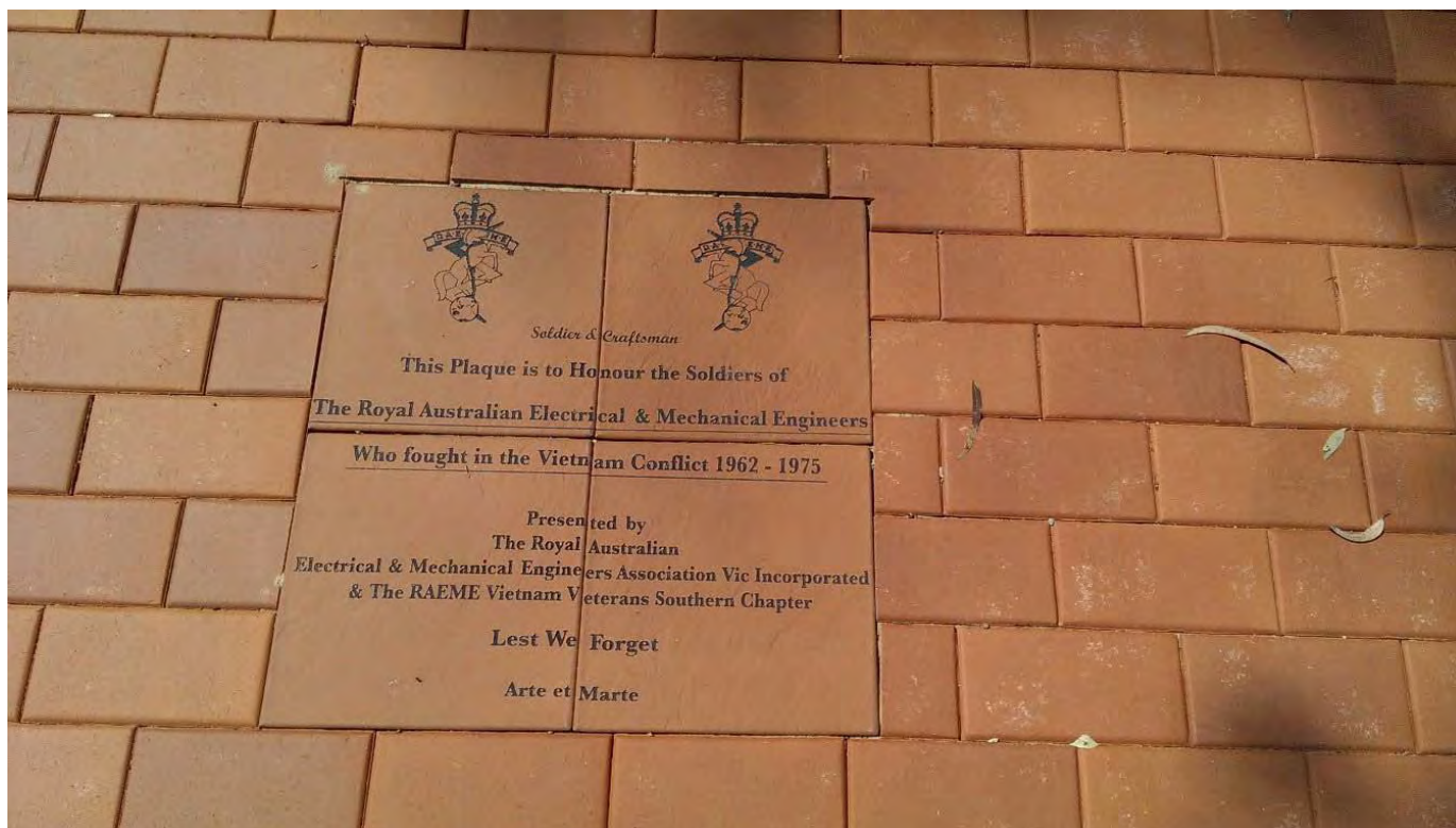
The long-awaited Pavers, sponsored by the RAEME Association (Vic) Inc and Vietnam Veterans Southern Chapter in place at the Seymour Vietnam Commemorative Walk.