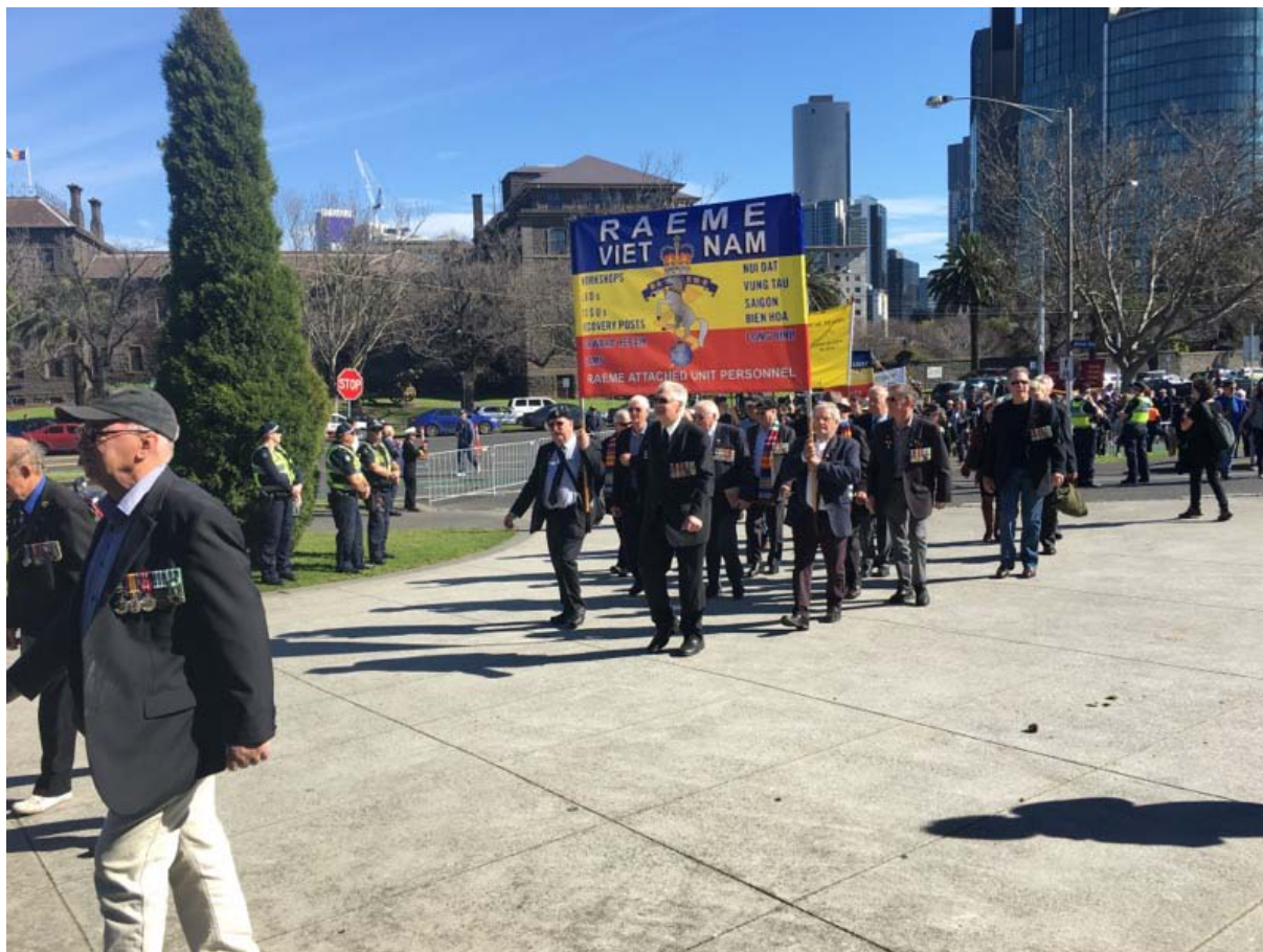
RAEME Vietnam Veterans Marching on Long Tan Day

Except as provided by the Copyright Act 1968, no part of this publication may be reproduced, stored in a retrieval system or transmitted in any form or by any means including posting to social media without the prior written permission of the publisher.